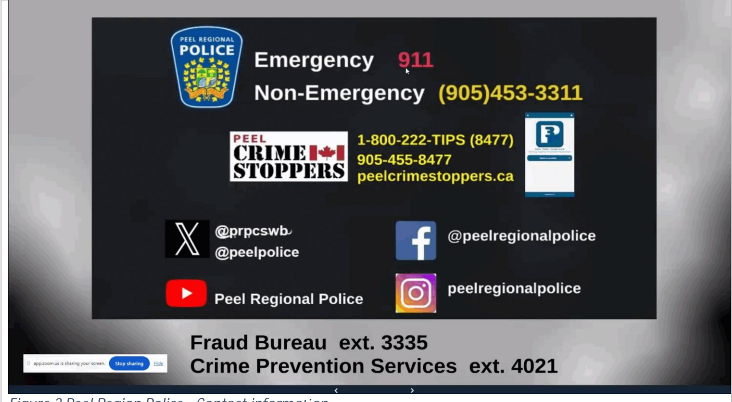
Figure 3 Peel Region Police - Contact information.